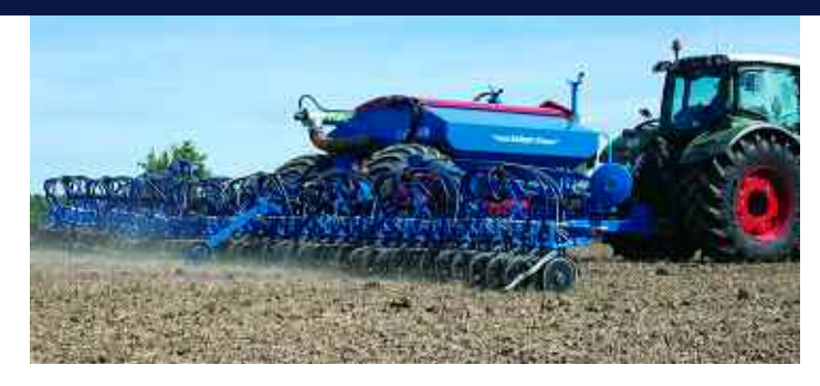
Lemken's Solitair 12 unit comes in working widths of 8-12m with an approximate hopper capacity of 5800 litres.

angle of the disc helps to minimise soil disturbance, uses less power and can reduce volunteer emergence. A carbide skim coulter runs alongside the disc to keep it clean, the height of which can be altered as the disc wears