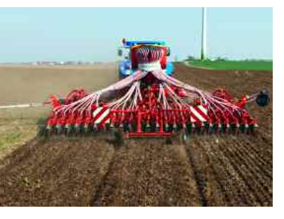
Pöttinger's Terrasem has a two-gang disc harrow with smooth or scalloped discs.

► tractor via the three-point linkage or combined with seedbed preparation implements.