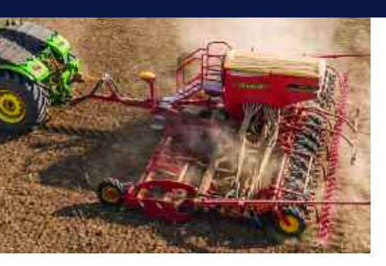
The Rapid has unique seed coulters and depth control which is adjustable from the cab.