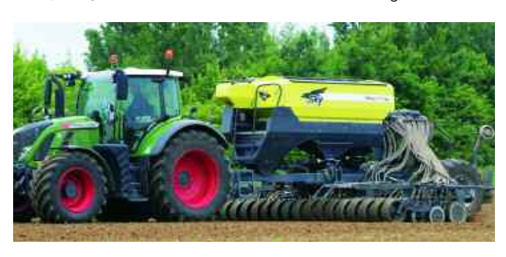
The Sky Easy drill can work direct into a cover or stubble, as well as into a cultivated field.

When equipped with the appropriate singling disc it can be matched to almost any seed type, says the firm. On the ED Special model, the fertiliser and singling drive are mechanical, however the ED Super is equipped with an electric drive for fertiliser metering as well as