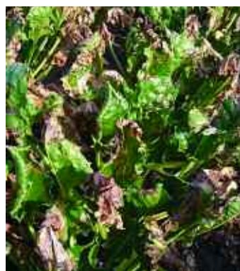
The third generation of beet leaf miner usually occurs from August onwards and a foliar insecticide is the only option for control.

Although other nematicides are being evaluated for use in the beet crop, in the short term there's nothing else growers can use. “The problem is we're completely reliant on nematicides for FLN control but we need to ▶