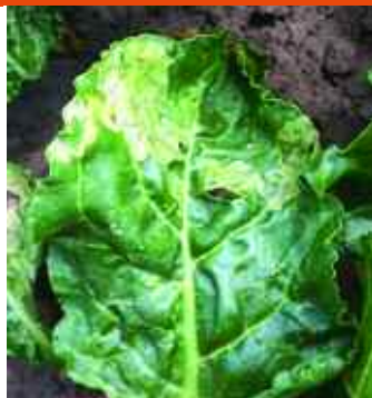
The mining and blistering damage caused by leaf miner reduces the green area of the crop and can cause additional problems.

The second generation neonics found in Cruiser Force (thiamethoxam+ tefluthrin) and Poncho Beta (clothianidin+ beta-cyfluthrin) have longer persistence.”