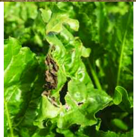
Downy mildew will likely have overwintered well.

Although generally a localised problem, where downy mildew does pop up there are no fungicides registered for use in the crop to control it. With yield losses of up to 30% from 40% downy mildew infection, there are