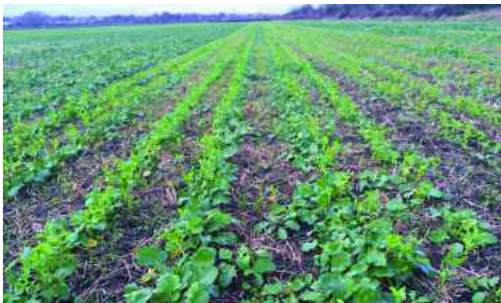
A companion crop improves OSR establishment and has been shown to reduce damage from slugs and flea beetle.

The roots have a jackhammer effect; the long, thin taproot grows straight down in the soil profile and is able to penetrate pans. The taproot doesn't branch so there's no lateral compaction of soil around it. The root quickly grows deeper than any agricultural machine can or should work, aerating the soil and creating channels for water to move through the profile.