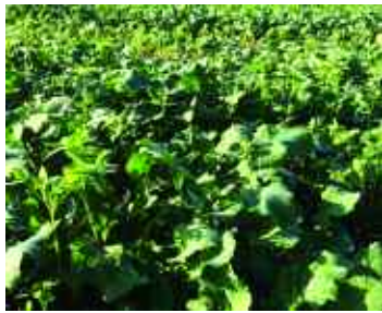
Berseem clover helps OSR to root and provides an effective companion, provided the correct variety is chosen with no winter hardiness.

▶ other hand, vetches are better able to capture nitrogen — typically 40kg N /ha, compared to 10-15kg N /ha by the clover.