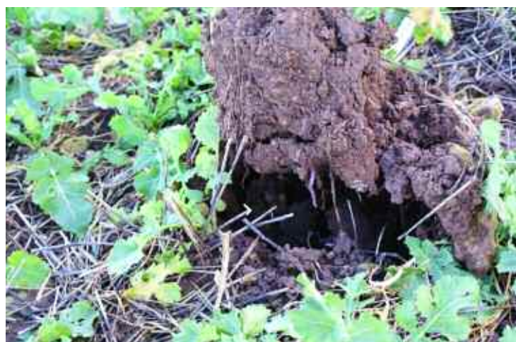
Companion crops with a low C:N ratio decompose quickly, releasing nitrogen back in the soil for the OSR crop to utilise in the spring.