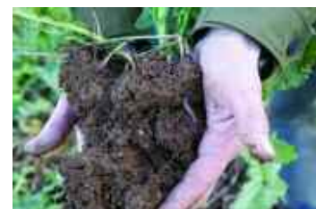
Mycorrhizal fungi in the soil greatly improve the ability of plants to access soil resources but OSR roots won't interact with them.

Although OSR has the most potential for companion cropping in the UK, there are also benefits with maize. Particularly valuable is when it comes to stabilising stubbles after harvest to prevent run-off and mopping up residual phosphates from slurry and digestate applications. ■