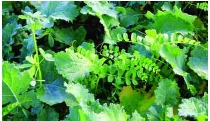
Vetches are more hardy, so clopyralid may be required for destruction, but they're better at capturing nitrogen.

Mycorrhizal fungi in the soil greatly improve the ability of plants to access soil resources but OSR roots won't interact with them. Planting berseem clover seed impregnated with mycorrhizae is one way of quickly bringing phosphate into play, which would otherwise be locked up, getting more value out of the soil.