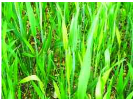
The tell-tale sign of S deficiency is that the yellowing affects new leaves, while N deficiency shows up in older leaves.

“In Scotland, Norman Scott recommended using micronized S in liquid form through a sprayer, but you couldn’t really get enough