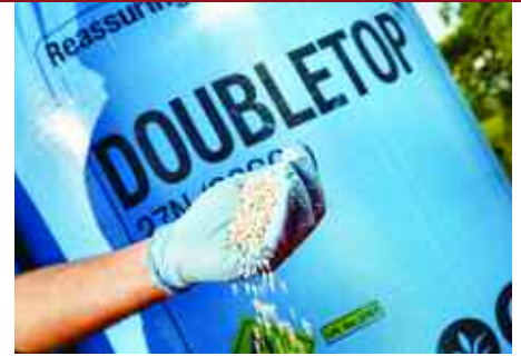
The aim is a product that's lump-free and dust-free, that contains the correct balance of nutrients in every granule.