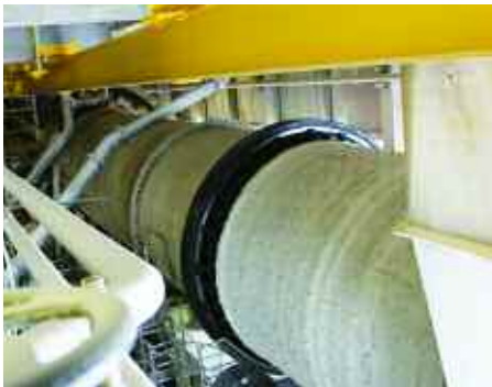
The drier, where moisture is removed from partially crystallised granules to ensure a good quality product.

In milling wheat, sulphur has an essential role to play in building the correct protein in the grain, but an early season dose should still be sufficient to supply this, she says. "Malting barley also needs S, but conversely uses it early on with the N to build yield,