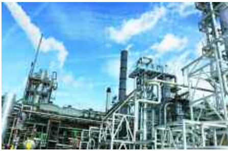
The fertiliser plant at Ince had always shown itself to be flexible, but an AN/AS compound had never been done before.