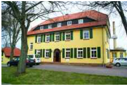
Nordsaat, based in Germany on what used to be the border between East and West, had been looking to get a foothold in the UK.

One of these was Nordsaat, another family-owned business based in Böhnshausen, Germany on what used to be the border between East and West. The company specialises in cereals, with barley, triticale, and oats joining wheat in an extensive programme that stretches across Europe from the Ural Mountains to the Atlantic. This includes hybrid wheat and triticale, with seed production covering 2200ha, while the business farms a total of 10,950ha.