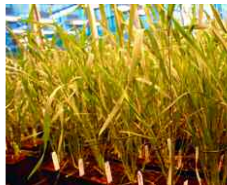
Around 30,000 new plants per year, sent in as 122 crosses, come back to Elsoms to be evaluated at Spalding and Cowlinge, Suffolk.

Elsoms currently has 90 wheat varieties at NL-1 and 800 at NL-2 and is on target to