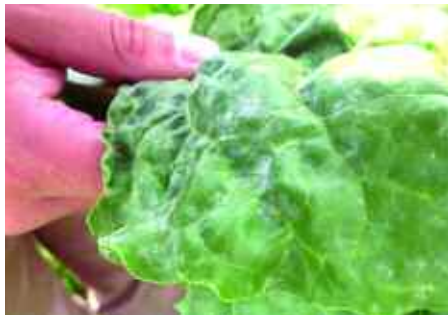
Powdery mildew hasn't been a major concern for most growers for the past five years.

► Development of cercospora is favoured by warm, wet weather with temperatures above 25°C and symptoms appear as circular spots (3-5mm) with necrotic,