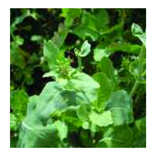
Some crops may benefit from later PGRs to help manipulate the canopy.

Resistance management of LLS is something to bear in mind when designing fungicide programmes, with some azole-resistant LLS strains having been identified in the UK, even if field efficacy currently remains good, reminds Paul also looked at the levels of disease control achieved with Refinzar compared to Difcor (difenoconazole).