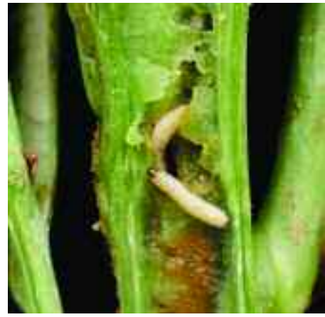
Where cabbage stem flea beetle larvae are stressing crops, boron can help the crop through.

Ben Burrows, independent agronomist with Crop Management Partners, reports