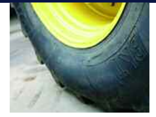
Agrimax Force radial tyres provide higher load capacity at lower inflation pressures than similarsized tyres.

BKT's Agrimax Spargo VF tyres are designed for row crop applications, whereas the Ridemax FL 693 M suits agricultural trailers. BKT says the reduced