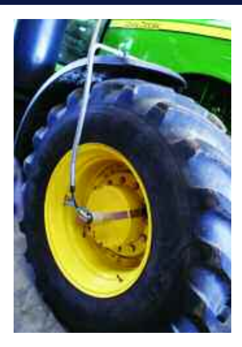
After-market inflation systems, although a great idea, have externally fitted pipework that could get damaged.

The Fendt is still fitted with its original Michelin IF650/65R34 and IF710/75R42 AxioBib tyres. The tractor is used for drilling, cultivating and some trailer work. According to Fendt, the patented system provides 15% more traction from the same horsepower, they say adjusting the tyre pressures provides higher traction, lower rolling resistance and lower fuel consumption. VarioGrip is controlled using Variotronic, which allows two pressures to be set and stored per axle.