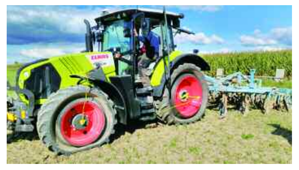
Mitas' PneuTrac tyre combines elements of rubber tracks with conventional pneumatic tyres and looks like a combination of the two.

"The lower pressure possible with the CHO (Cyclic Harvest Operation) SVT tyre allows a 24% increase in footprint to spread the load and protect soils when running with full grain tanks and mounted