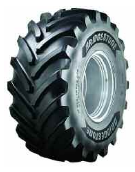
Bridgestone's VT-Combine tyre offers 20% more load compared with conventional standard tyres.

cutter bars without needing to go to wider widths," explains Kirk Walker.