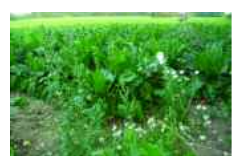
Tall weeds have a dramatic effect on potential crop yields in sugar beet.

"Debut also adds to blackgrass control. Both anecdotally and in BBRO trials, carried out at Brant Broughton in Lincolnshire in 2013, they showed that two applications of triflusulfuron-methyl added to blackgrass control compared to a standard mix," adds Pat Turnbull. ■