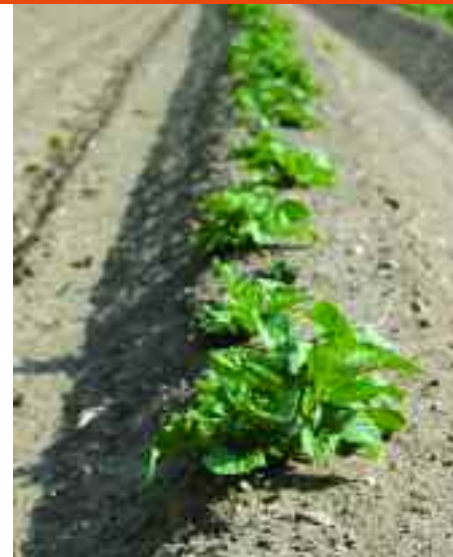
Make sure fungicides are in stock in advance of the first blight warnings.

pressure situations or where blight is active. The cymoxanil component moves through the leaf, while the fluazinam offers stem blight control.