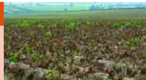
More virulent strains of the alternaria pathogen attack later in the season and cause rapid leaf defoliation, with subsequent loss of crop yield and tuber quality.

Initial treatments with Amphore Plus target