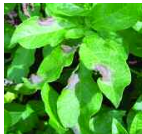
The new Hutton Criteria should help growers stay ahead of blight.

Even so, any blight control strategy has to address the ability of the disease to build up very rapidly in the right conditions, he advises.