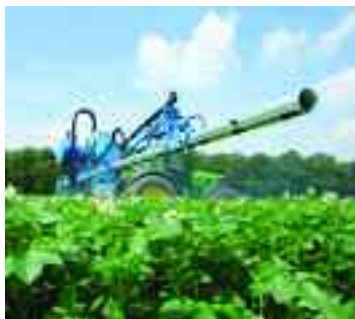
Levity's amine N product (Lono) can be used as an agronomic tool to influence the marketable yield of the crop.

Source: DJ Marks, S Wilkinson and AK Weston, 2018. Influence of foliar stabilised nitrogen on potato tuber yield, Proceedings of CPNB 2018.