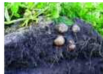
Small bursts of the amine form of N influence partitioning by promoting tuber production without stimulating top growth.

The nitrate form stimulates plants to produce auxins, which is why overapplication causes excessive top growth in the potato. If the plant has access to nitrogen in the form of \text{NH}_2 , it can use this locally, using less energy to convert it to protein and without triggering unwanted auxin synthesis. Cytokinin production means the potato plant produces more lateral growth, is bushier with a more fibrous root system and has increased tuber development.