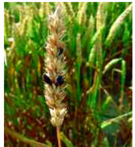
If dust or fragments of sclerotia are found to be the reason for alkaloid contamination of healthy grain, then removing sclerotia as early as possible in the grain handling process will be necessary.

The results from the current ergot project will help inform UK and EU