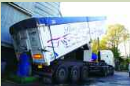
If the European Commission introduce a maximum limit for ergot alkaloids, it will be impossible to test loads on intake because there isn't a rapid test available.

“We’ve been working with our colleagues in Europe and it’s agreed that meeting the standard imposed by an alkaloid limit is practically unworkable for processors. Control of sclerotia will remain the simplest, most cost effective and timely way of protecting consumers.”