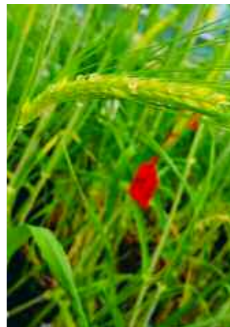
It's possible that alkaloids contained in honeydew may be responsible for contaminating adjacent healthy grains.

“The industry is in a similar position to when the DON and ZON mycotoxins first hit the headlines in 2006. The AHDB monitoring helps create a national picture and enables us to prepare for any future legislation,” he concludes. ■