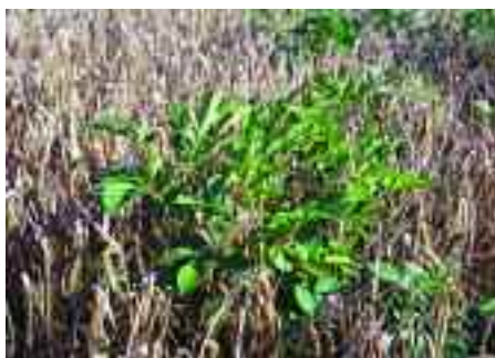
An important part of cultural control is to make sure volunteer potatoes in stubbles and on discard piles are destroyed.

► “Chlorothalonil is an active that’s worth looking at as it’s very rainfast and relatively cheap,” says John. “Mancozeb has the practical disadvantage that it’s very bulky. But it’s possible to get around this by using co-formulated products with a decent amount of mancozeb in them, such as Valbon (benthiavalicarb + mancozeb) and Invader (dimethomorph+ mancozeb).”