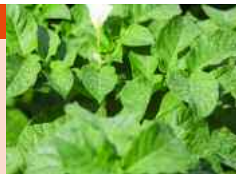
Using drift retardants (Crusade or Sterling) with certain blight products is suggested in the new guidelines as one of the ways to enhance foliar blight control.

The performance of Crusade has been proven