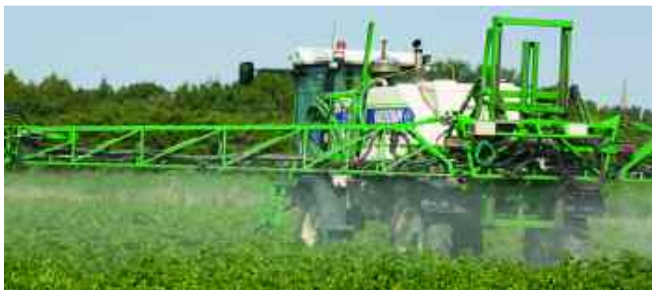
Careful planning is needed to make sure products with tuber blight activity are available for use at the end of the season.