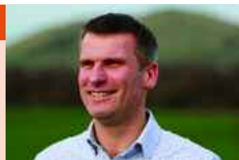
Greg Dawson says the development of fluazinam resistance raises questions as to how the remaining products can be used without breaching resistance management guidelines

The fluopicolide in Infinito has a unique mode of action for tuber blight control while both cyazofamid and amisulbrom are in the Qil mode of action group so cannot be repeatedly used in alternation or mixtures with each other. The