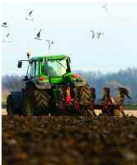
Rotational ploughing is still one of the key elements in integrated blackgrass control but is only effective if good inversion is achieved.

► straw and germinates consistently at the same time.”