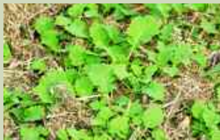
As well as competing with the wheat crop and providing an ideal environment for slugs, OSR volunteers can seriously interfere with the management and productivity of future OSR crops.

"This wouldn't be a problem but for two things. First, every 10kg/ha lost is typically more