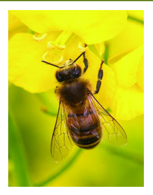
OSR provides the biggest source of early pollen and supports a vast range of biodiversity.

► adults, by ensuring actual contact with the target was achieved, even by spraying at night, when the adult beetles seemed more active in the crop."