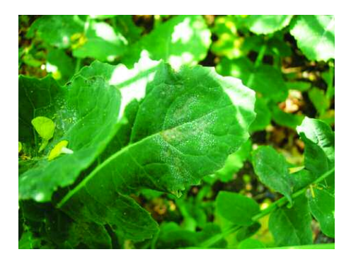
Bayer's Spotcheck is revealing high levels of light leaf spot in some regions.

Blanket spraying is something that concerns David too and he's heard reports of as many as five treatments being applied to control adult flea beetle. The problem extends into other crops, he says, and it's a practice that needs to be firmly stamped out.