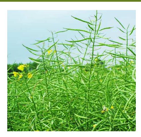
Rhizoctonia infection affects the evenness of flowering and pod maturity later in the season.

"The impact of tillage on disease by different AGs isn't completely clear, but rhizoctonia root rot caused by AG8 (low incidence in English soils) is favoured by direct drilling systems where no cultivation is performed. Ploughing or cultivation to 8-10cm depth can disturb hyphal networks and reduce incidence of disease," she adds.