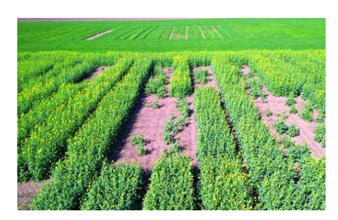
Of the three AGs that effect OSR, AG2.1 is the most pathogenic.

surface area. Furthermore, inoculated trials demonstrated that R. solani AG2-1 is capable of reducing final yield of OSR by up to 50%. The pathogen also affected crop development, with surviving infected plants having delayed maturation and uneven flowering across the field," she explains.