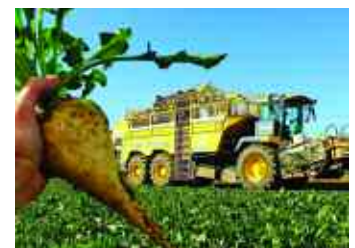
The highest sugar content variety added to the RL is BTS 4100 from Limagrain, which is listed at 18.4%.