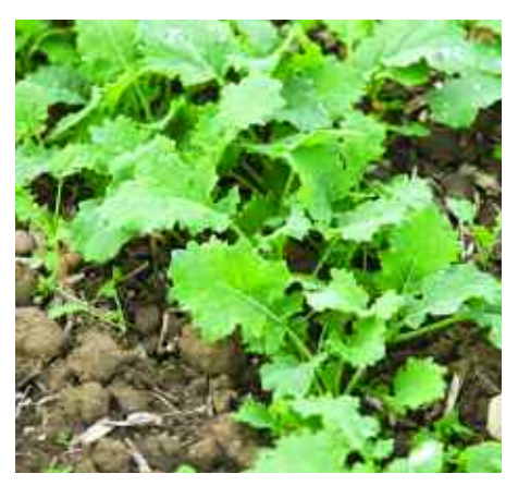
Low seed rates mean that when volunteers emerge in the field, they become a significant part of the crop.

Vasilis notes that phoma can be easily controlled with available chemistry, but