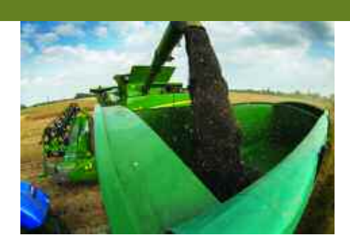
It doesn't take many high erucic acid seeds from volunteer OSR plants to push levels up in the sample.

"Already, some of our hybrids are good on verticillium wilt, but we are working to develop traits that we can really call 'resistance', which are about 2-3 years away," he adds. ■