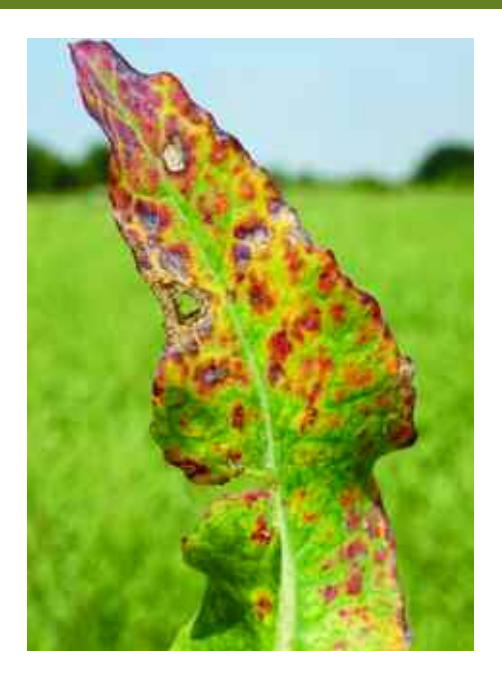
TuYV resistance is one of the traits that will be bundled with several other traits as standard in new varieties.

▶ "It allows us to weed out varieties that go up and down like a yoyo, and ensures we only place the most stable into the National List trials and subsequently into the market," explains Vasilis.