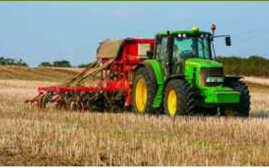
Under no-till and/or higher stubble environments, losses from urea could be higher, with increased ammonia production.

► range of substances that have a urease inhibitor effect and the majority of these are phosphoramidate compounds, such as NBPT (n-butyl-thiophosphoric triamide) and NPPT (N(n-propyl) thiophosphoric triamide).