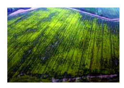
Following an epidemic of cabbage stem flea beetle last year, many growers are choosing to move away from the crop this year, says the NFU.

"We feel that this is necessary following the highly politicised decision from the government to ban neonics. There's a