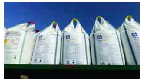
The type of fertiliser used has come under scrutiny in Defra's draft Clean Air Strategy.

The AHDB Fertiliser Guide, RB209, provides guidance on how much total N to apply, depending on expected yield, he explains. "If you applied enough for a 10t/ha crop, but only achieved 8-9t/ha, for example, there's likely to be surplus N left in the soil — the best way to capture that is to establish a