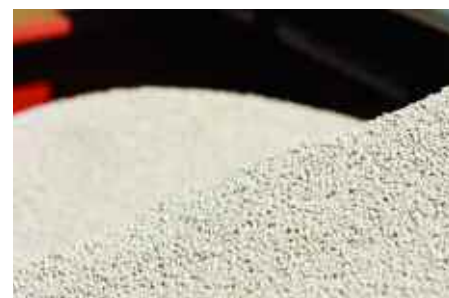
Compound products applied in spring give the crop the readily available S, P and K it needs.