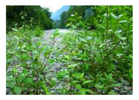
Endophytes that can fix nitrogen from the air were discovered in willow and poplar growing along the banks of the Snoqualmie River in the USA.