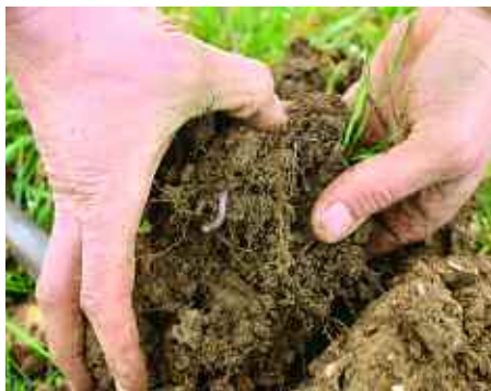
The carbon and microbial activity are built in through the herbal leys.

That said, cover crops and herbal leys are undersown into the preceding standing