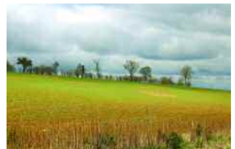
When the cattle move up the hill to graze the silage bales, they also move the nutrients and the goodness uphill to the poorer soil.

The first partnership arrangement was with sheep-grazing, which also heralded the first livestock to come to the farm since it went all-arable a decade earlier. “But share farming doesn’t work quite so well with ▶