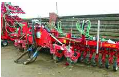
Cover crops and herbal leys are undersown into the preceding standing crop using a 6m Einböck Chopstar-Seeder.

crop using a 6m Einböck Chopstar-Seeder, modified with low disturbance Metcalfe points that doubles up as an inter-row hoe. A 12m Einböck tined weeder is fitted with a pneumatic seeder to distribute small-seed crops into established cereals.