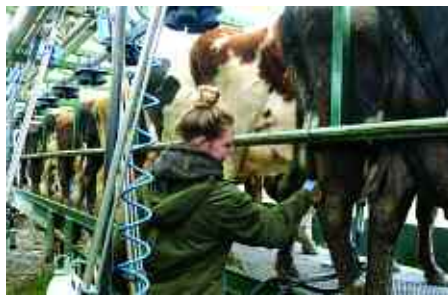
The herd is passed through the mobile milking parlour (left) once a day and moved onto fresh pasture, followed by the mobile chicken enterprise.