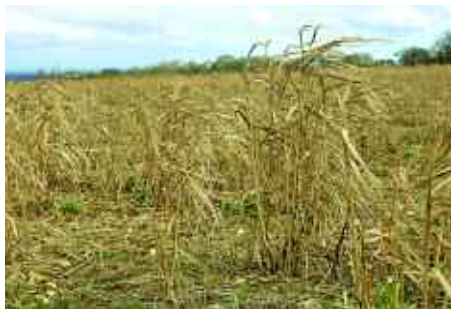
A 30ha crop of miscanthus was established last year on clay soil that has proven very hard to make into a consistently good seedbed. The plan is that the perennial crop will increase the carbon content and harness the greater cation exchange potential of the soil that annual crops struggle to access due to poor establishment.

"We took the step a few years ago to survey the local community to find out what they really wanted from the estate. The feedback we had was very positive and overwhelmingly people wanted access to the woodland. We didn't want to offer this for free, so figured there must be a business opportunity in it."