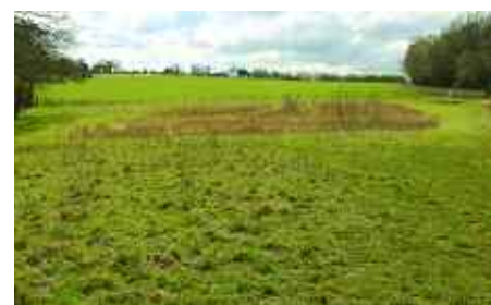
Ibworth Woodlands burial ground has received the first of its guests.

"I think there's also scope for a farm shop — not something I'd like to run myself, but I'd be keen to find a partner who'd like the