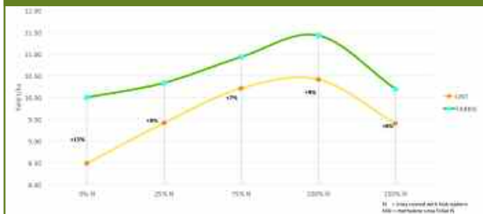
Winter wheat independent trials in Suffolk during 2020