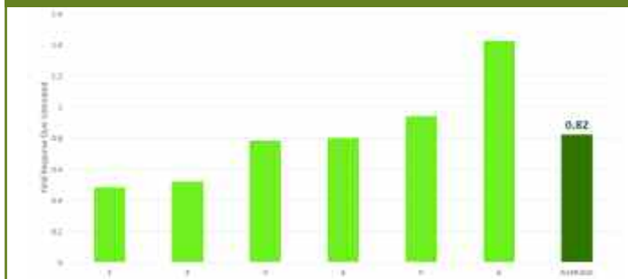
Uplift from Tiros treatment in independent trials series carried out 2019-2020.