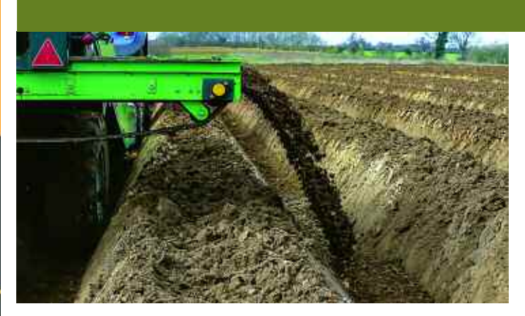
Studies indicate that those growing roots or other field vegetables can improve soil health by doing the right things in between crops like potatoes and sugar beet.