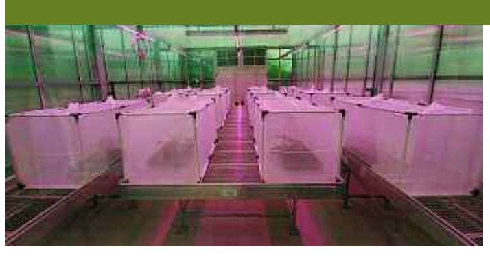
A key thing to get right was putting precise numbers of each clone in the cages, getting spray coverage spot on and sampling the right number of aphids for testing to avoid ruining any experiment.

USE PLANT PROTECTION PRODUCTS SAFELY. Always read the label and product information before use. For further information including warning phrases and symbols refer to label. Corteva Agriscience UK Limited, CPC2 Capital Park, Fulbourn, Cambridge CB21 SXE. Tel: 01462 457272. "Trademarks of Corteva Agriscience and its affiliated companies. © 2022 Corteva, Belkar* contains halauxifen-methyl (Arylex** active) and picloram.