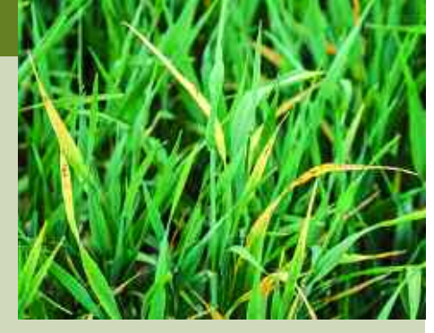
Winter barley is particularly susceptible to BYDV and can result in yield losses of up to 80% if the vectors aren't controlled.

Quantifying the proportion infected in a rapid and affordable manner as been a problem in the past, but Rothamsted Research has recently developed a method to test aphids caught in