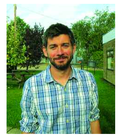
So far results have shown that ACroBAT recommends less sprays and provides as much protection as the BYDV Tool, reports Sacha White.

It allows growers to enter their location and crop emergence date, then counts accumulated day degrees above a baseline ►