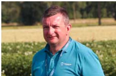
Ed Bingham says growers can dramatically reduce volunteer survival with a well-timed application of maleic hydrazide.

► Reuben. "There's a difference between burning off the haulm of volunteers and getting herbicides down into the daughter tuber to stop them coming up."